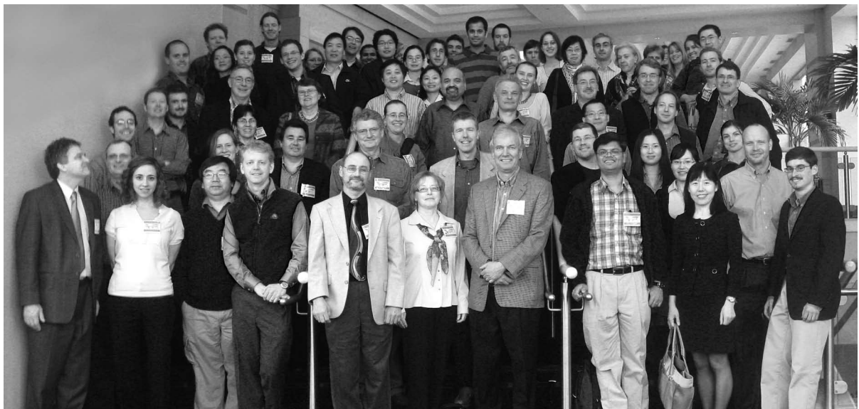
LCLUC 2010 Spring Meeting participants