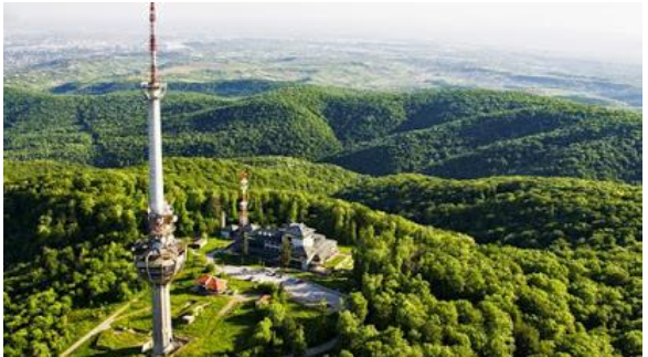
Figure 2: Locations to be visited during the LCLUC field trip. The discussion topics are outlined above in the agenda (prior page).