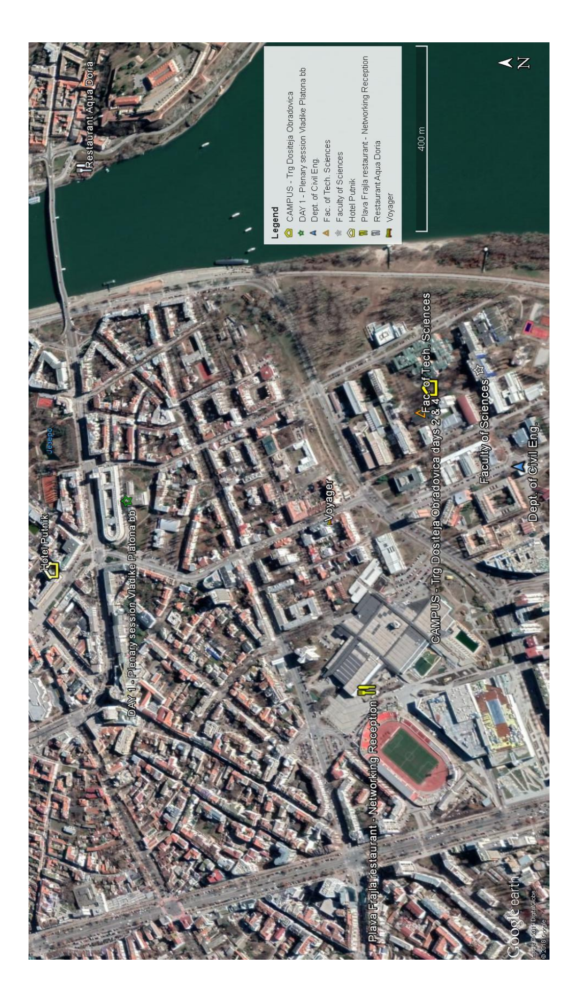
Figure 1: SCERIN-7 will be held at 2 different locations, as follows: Day 1 Vladike Platona Str. (in green, star symbol), Days 2 and 4. The University of Novi Sad. SCERIN-7 recommended hotel is Hotel Putnik (in yellow, house symbol). We will have networking and dinner opportunities at restaurant Plava Fraila (in Yellow, fork and knife symbol).